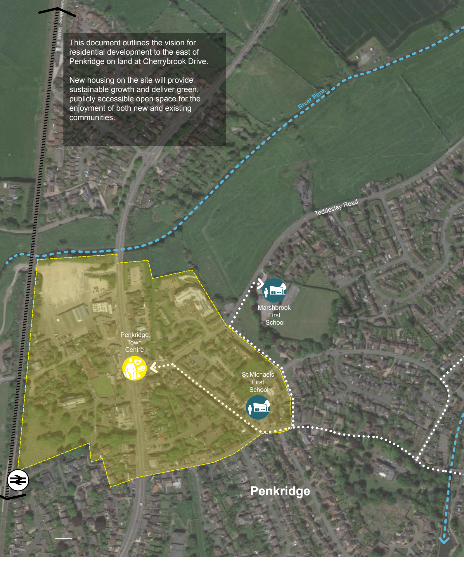
Figure 2: Site Location and Relationship with Penkridge _{\mbox{\scriptsize N.T.S}}