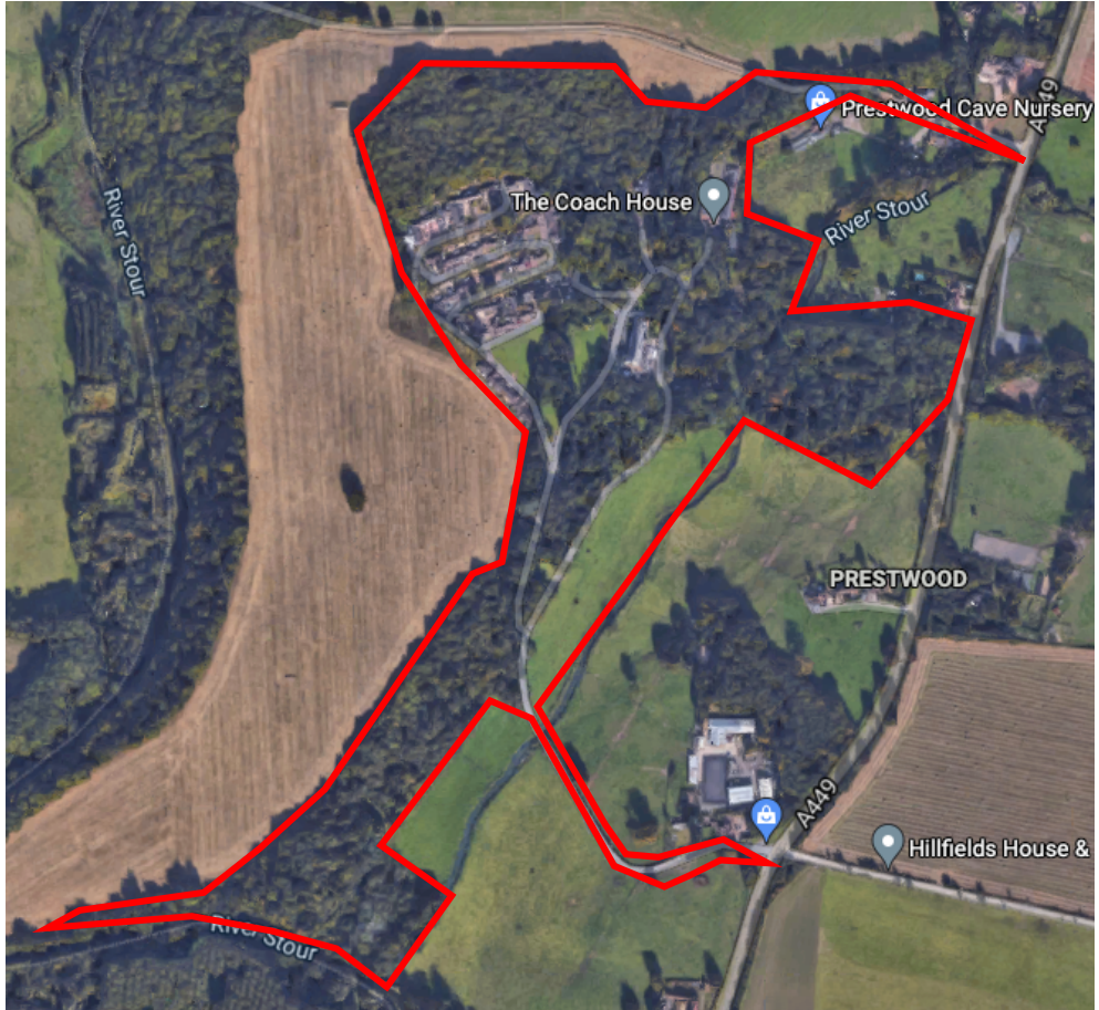
Aerial Photo of the extent of the site

3.8. It is acknowledged that the site is covered by the West Midlands Green Belt, but there are no other planning or environmental constraints or designations affecting the site.